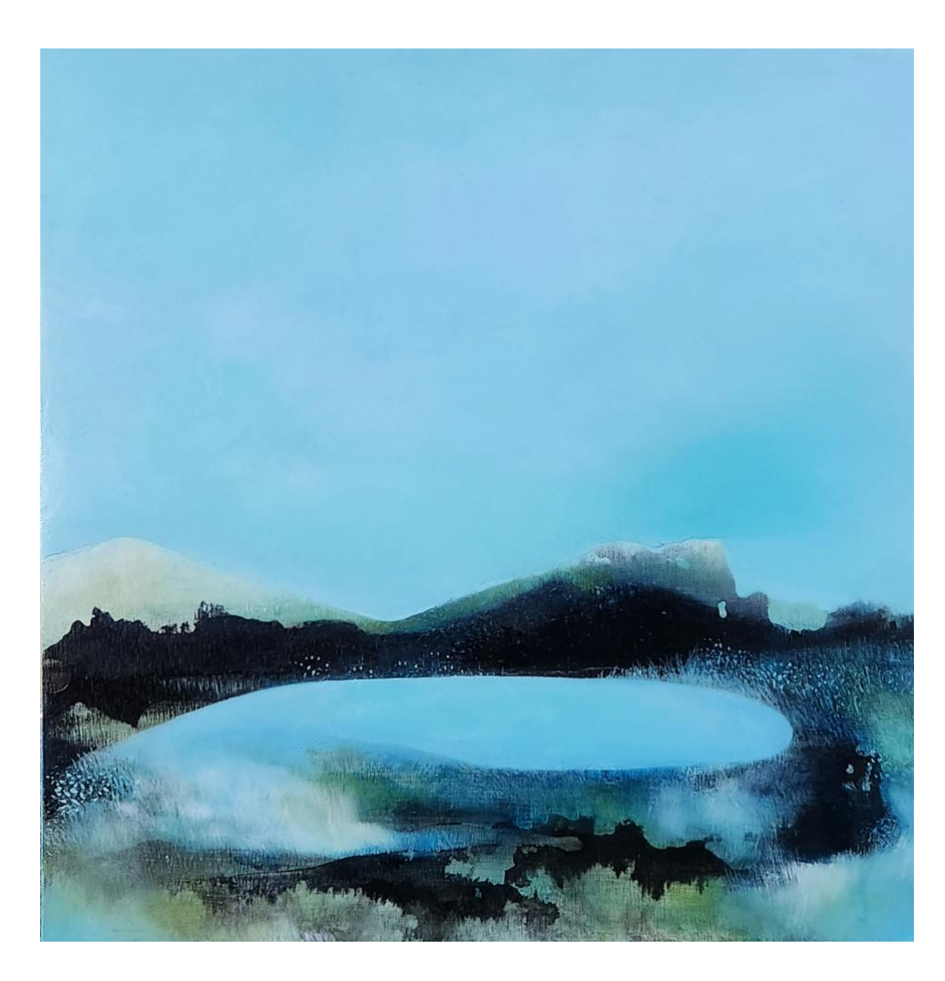
Te Ao 6 Sue Leeming 2023 oil, ink, cold wax on marine ply (framed) 40 x 40cm $1200