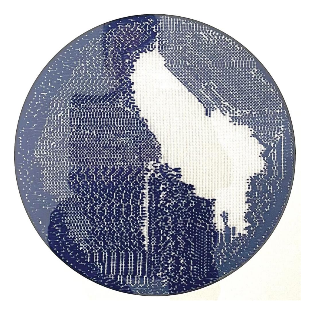
Tracings (inbetween spaces) (detail) Antonia Radich 2023 cotton on linen (framed) 46.3 x 42cm $1100