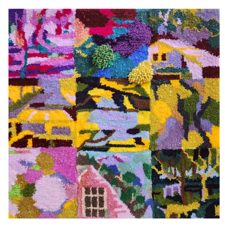
Back Together Johanna Valom 2023 wool and acrylic yarn hand tufted rugs on monkscloth 68 x 68cm $2200