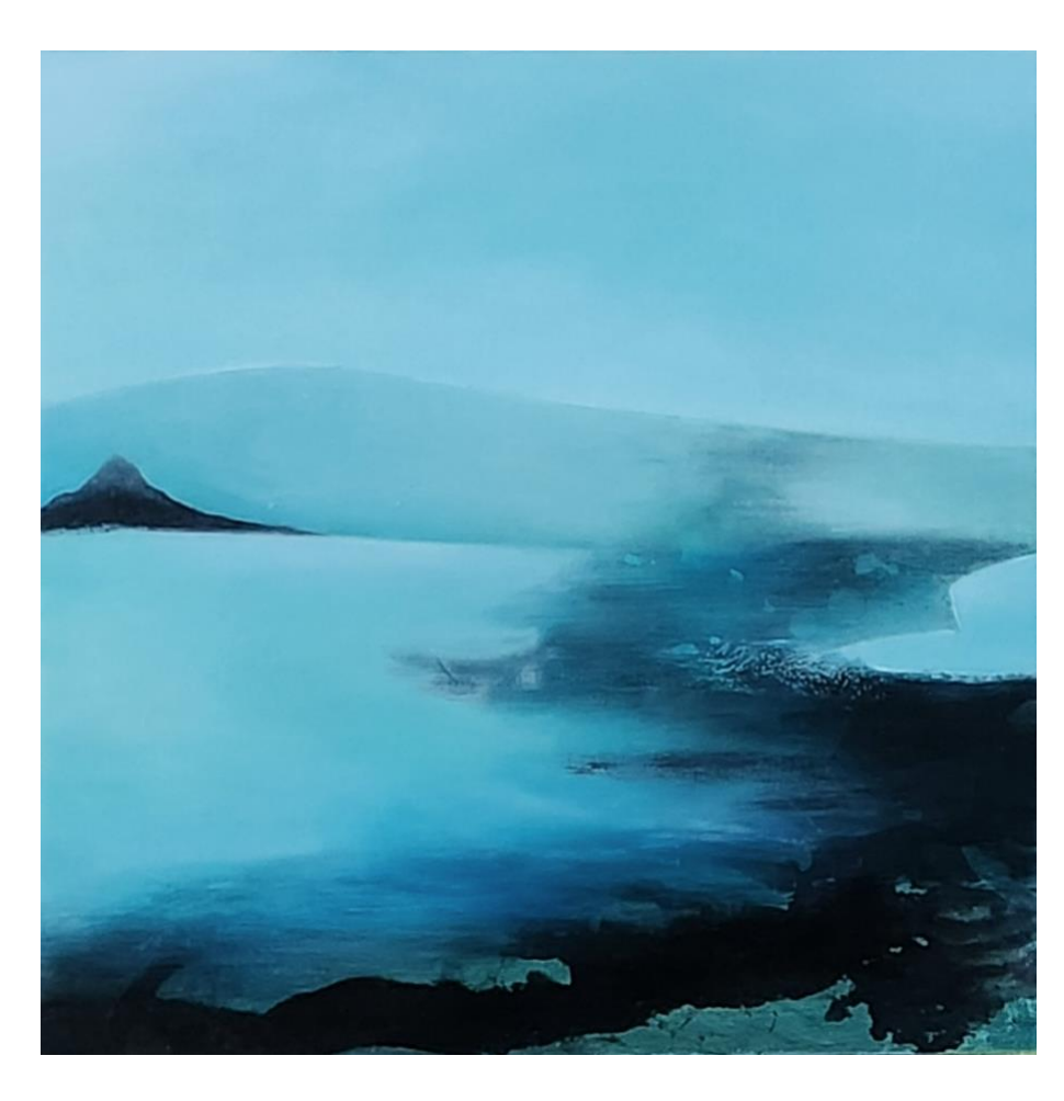
Te Ao 3 Sue Leeming 2023 oil, ink, cold wax on marine ply (framed) 40 x 40cm $1200