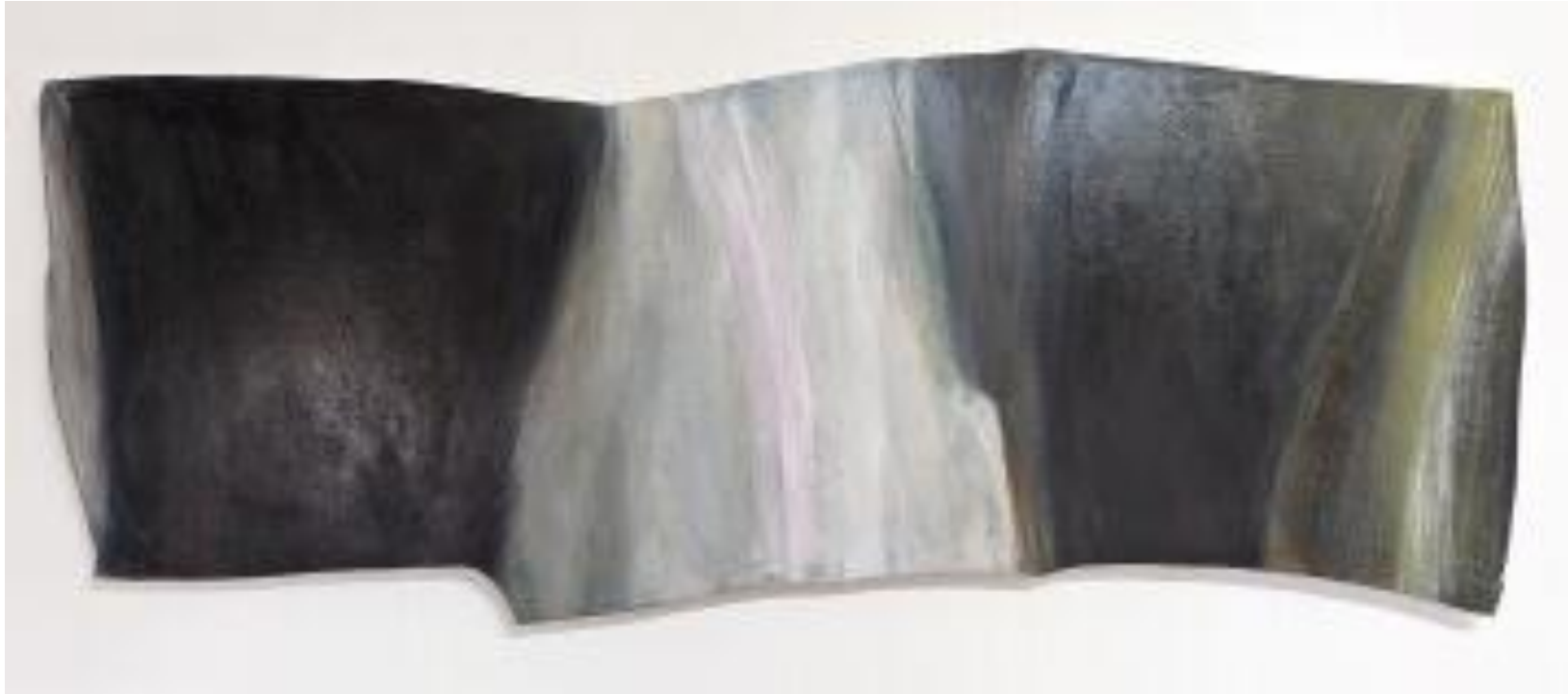
Wind 2023 mixed media on marine ply 42 x 116cm $1800