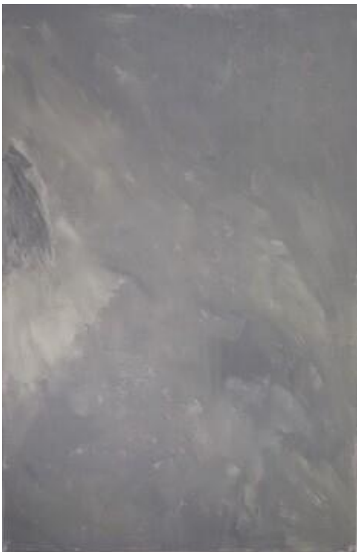
Breath (The way in) 2