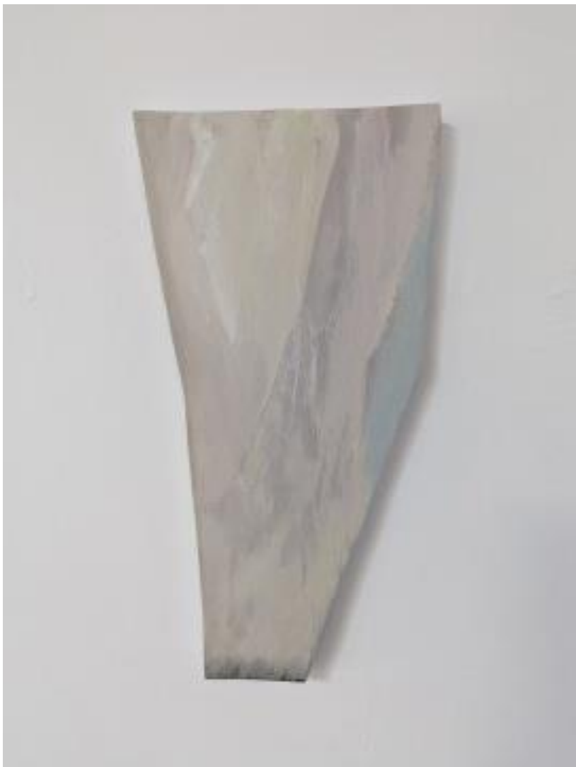
Holes in the wind 6