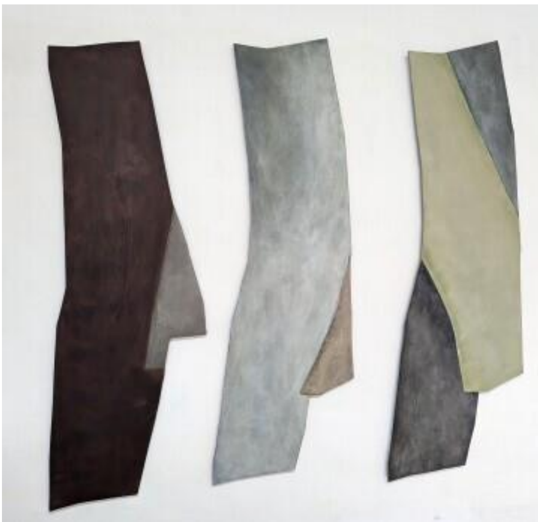
Mangroves, they talk in code (triptych)