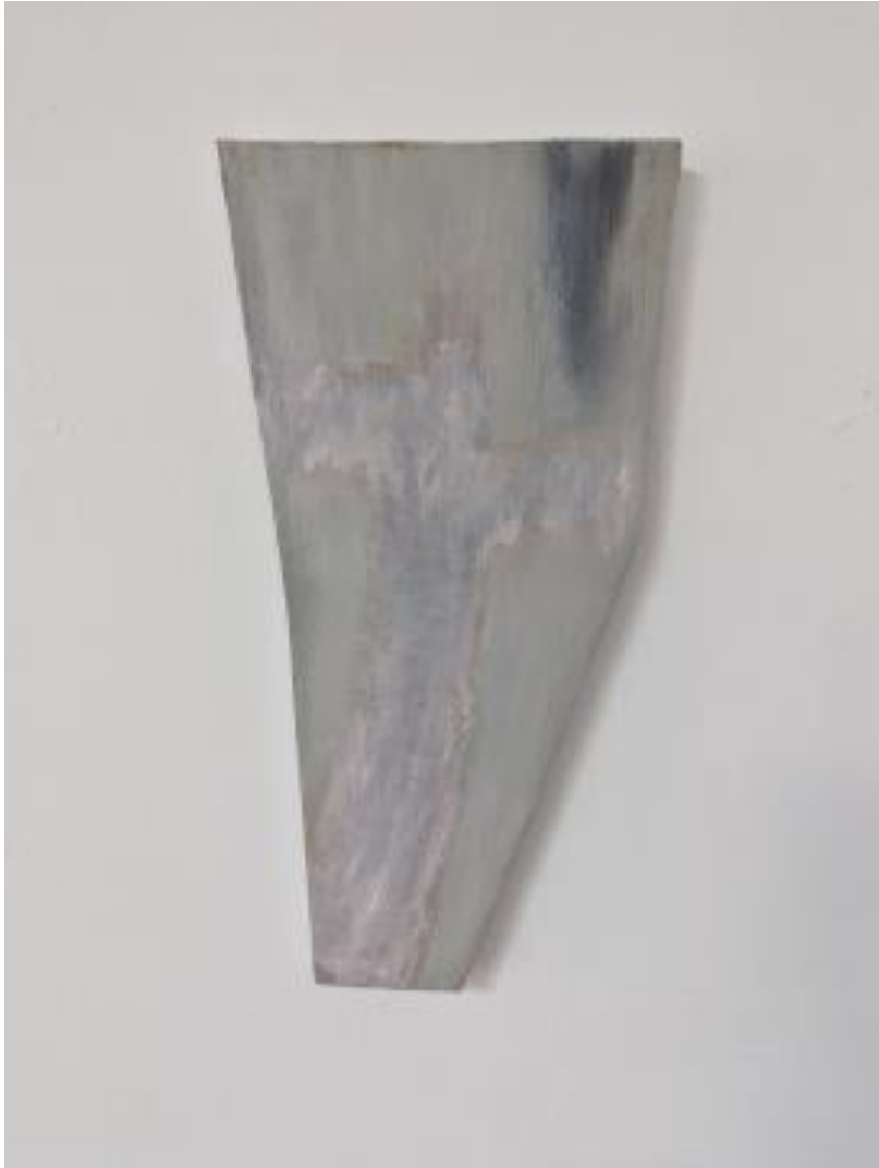
Holes in the wind 4