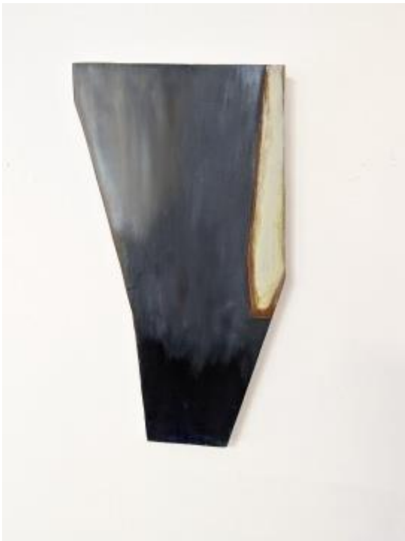
Holes in the wind 3