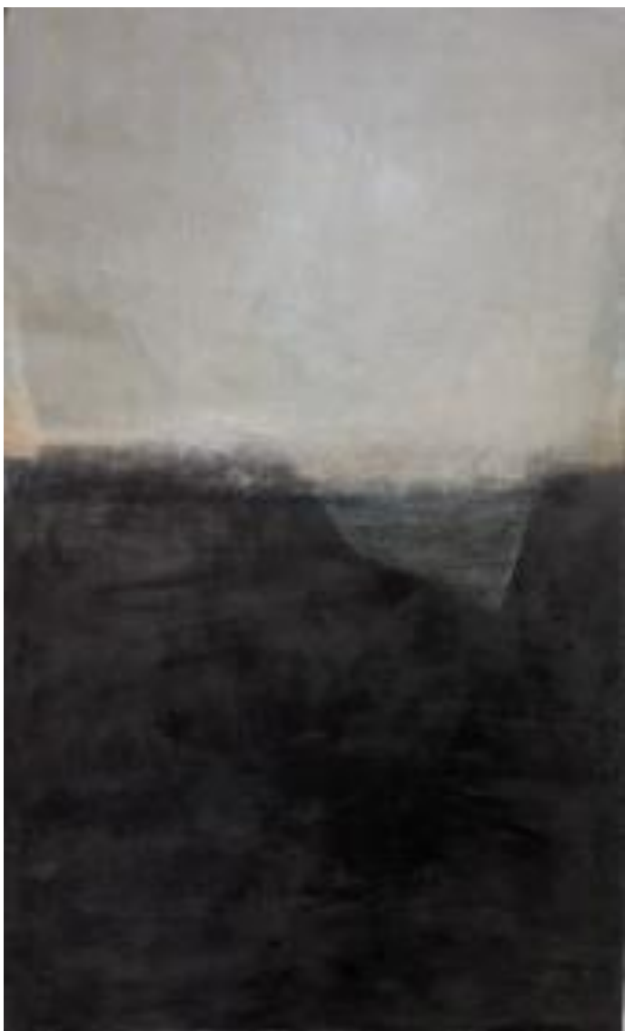
From the cloudbank 2 2023 oil on canvas on mounted wood 114 x 70cm $1900