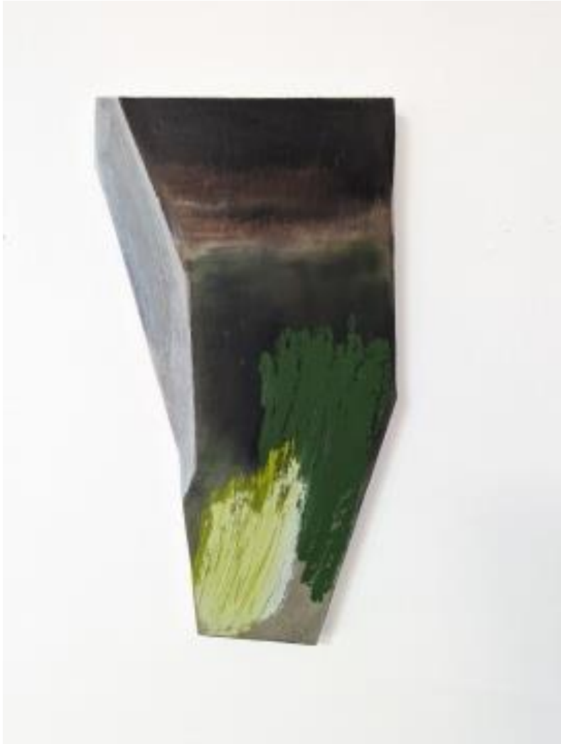
Holes in the wind 2