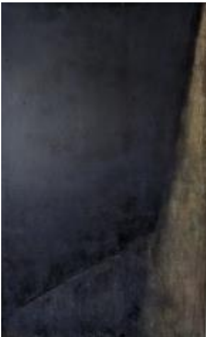
From the cloudbank 1 2023 oil on canvas on mounted wood 114 x 70cm $1900