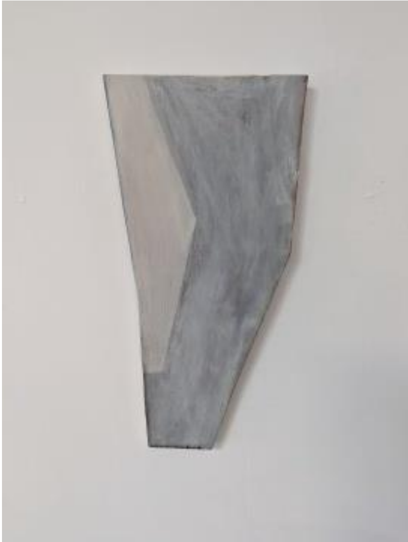
Holes in the wind 5