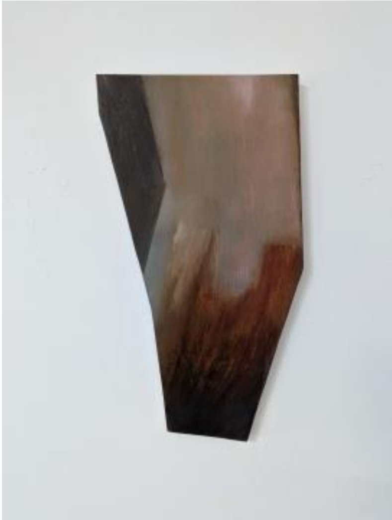
Holes in the wind 1