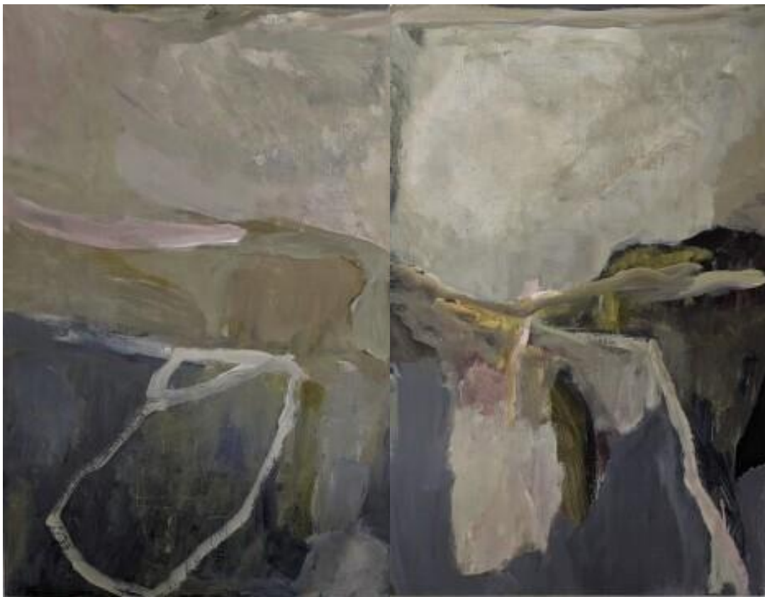
Breath (The way in) 1 3 (diptych) 2023 oil and acrylic on wood 2 panels, each 120 x 80cm $4500