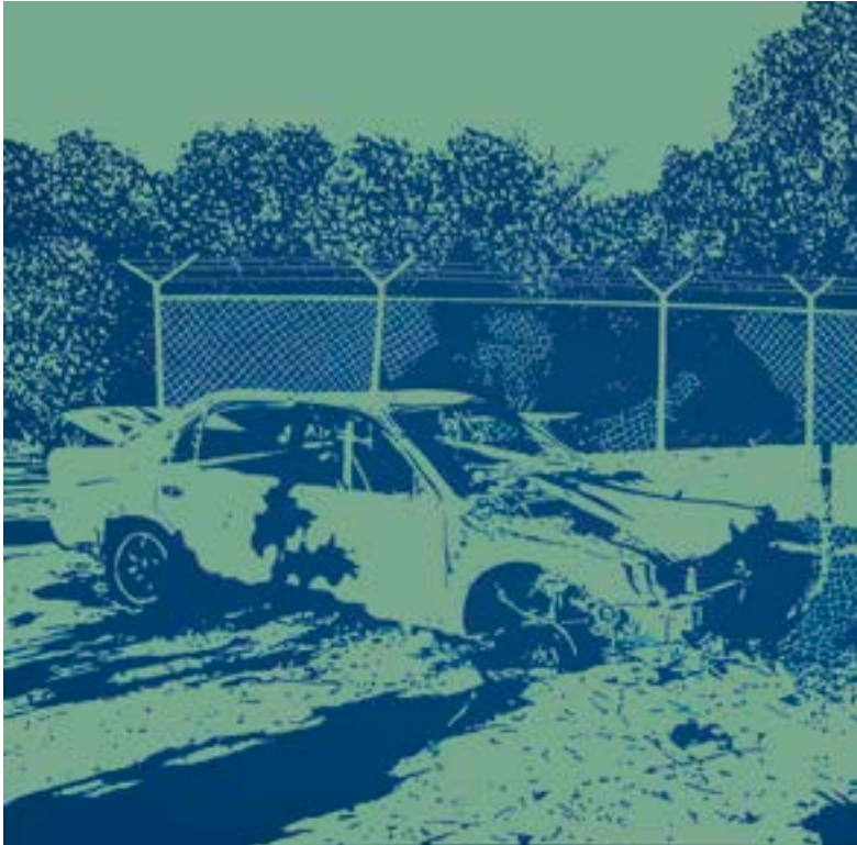
Bad Parking 2022, acrylic on canvas, 76 x 76cm, $2200