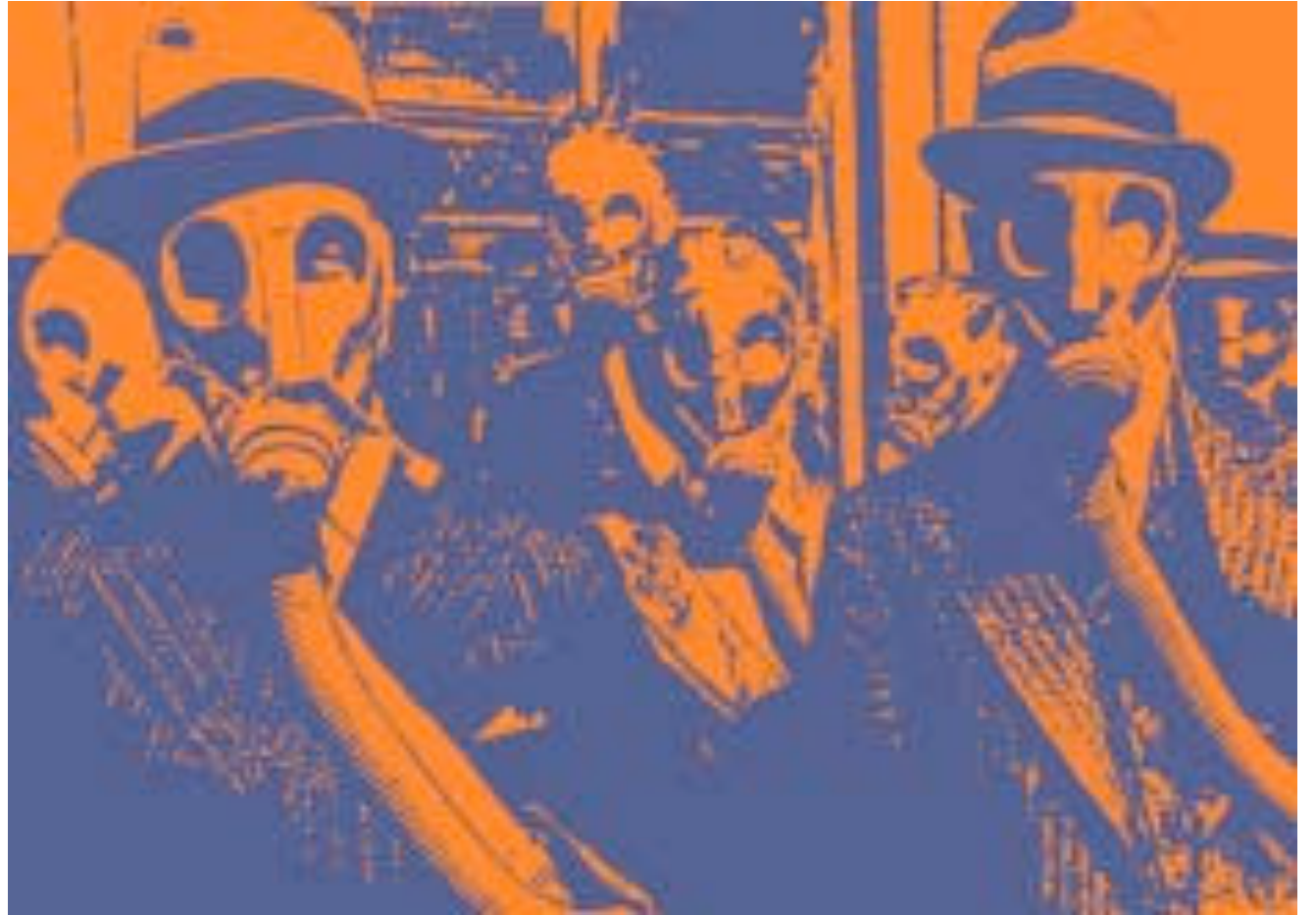
Nothing To See Here 2022, acrylic on canvas, 120 x 170cm, $4000