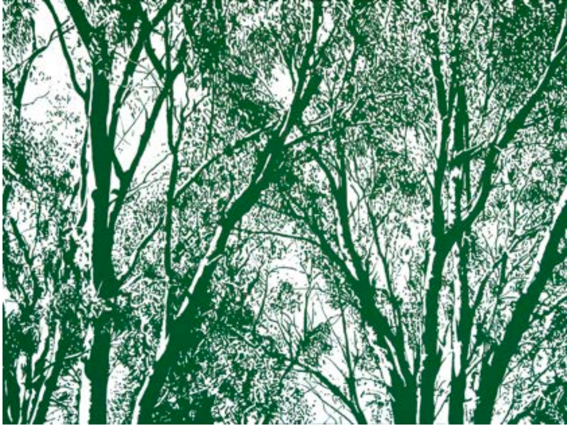
Park Life , 2022, acrylic on canvas, 76 x 102cm, $2500