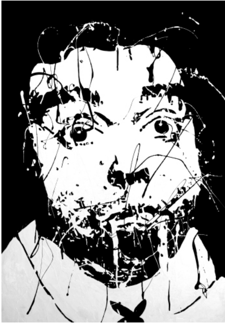
Too Much But Never Enough , 2022, acrylic on canvas, 102 x 76cm, $2200