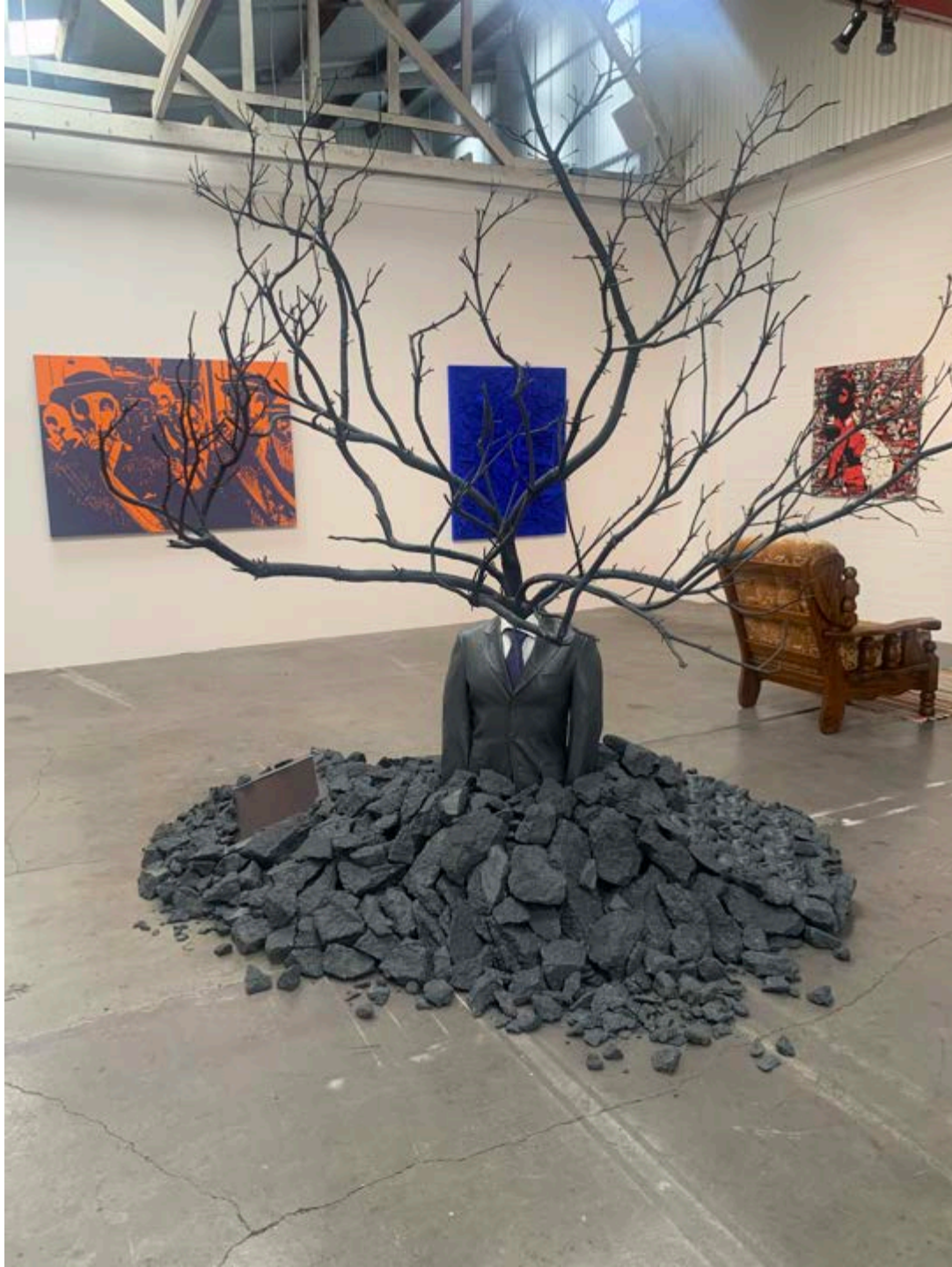
No Fate But That We Make , 2022, mannequin, suit, tree, acrylic, rubble, digital video, monitor, CPR dummies on canvas, dimensions variable, POA