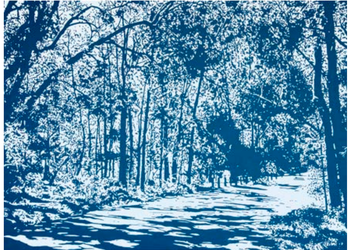
The Way 2022 , acrylic on canvas, 91 x 122cm, $3000