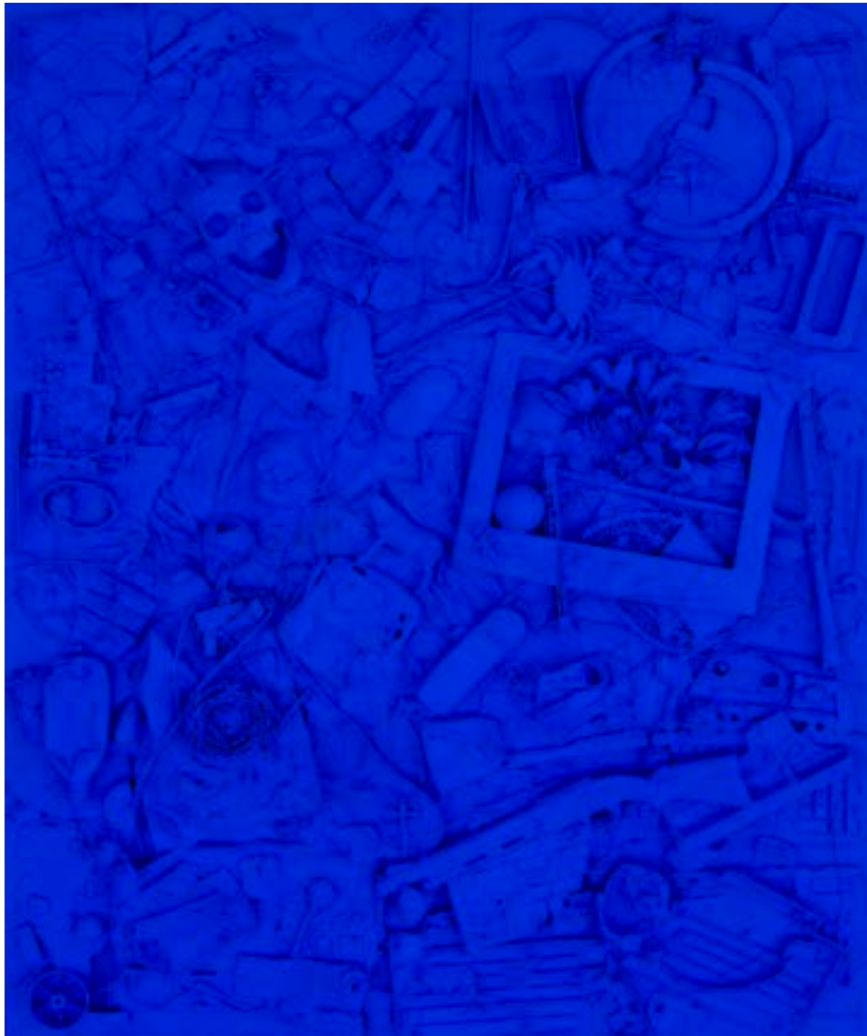
Blue Monday 2022 , acrylic on detritus on canvas, 150 x 120cm, $4500