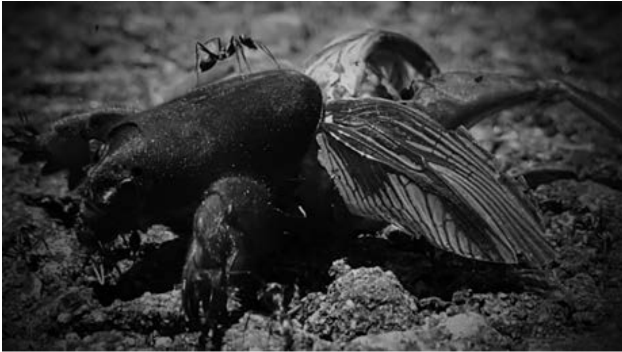
Sandgroper , 2022, digital video, Edn. 1/5, 10 minute loop, $1500