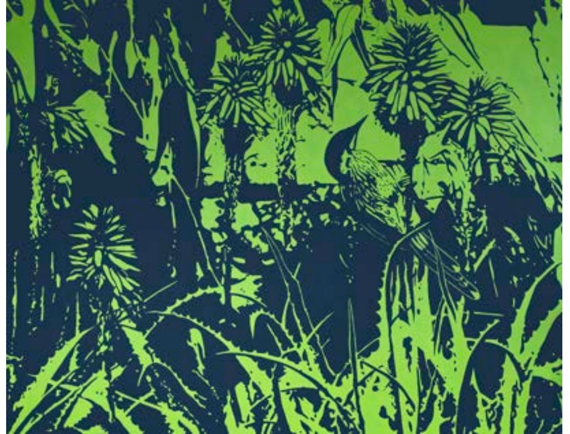
Bring Nature Home , 2021, acrylic on canvas, 120 x 150cm, $3500