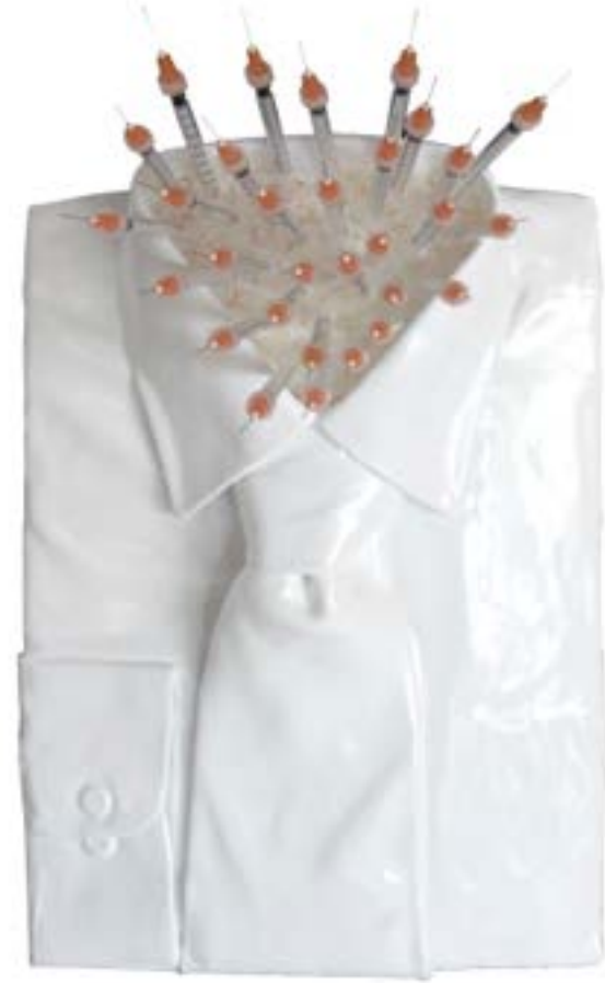
Pricks , 2022, syringes, enamel on shirt and tie, 32 x 22 x 15cm, $2200