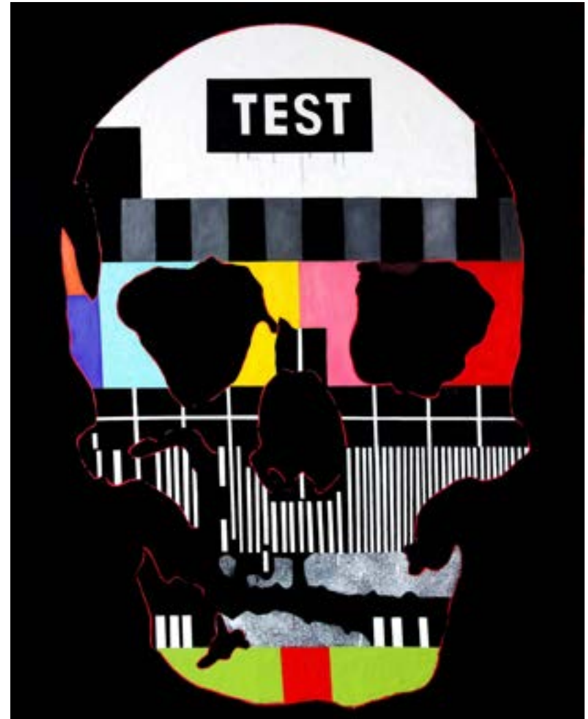
Medication Nation 2022 , oil on canvas, 150 x 120cm, $3500