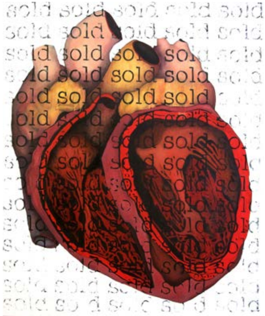
Sold Out 2022 , oil on canvas, 150 x 120cm, $3500