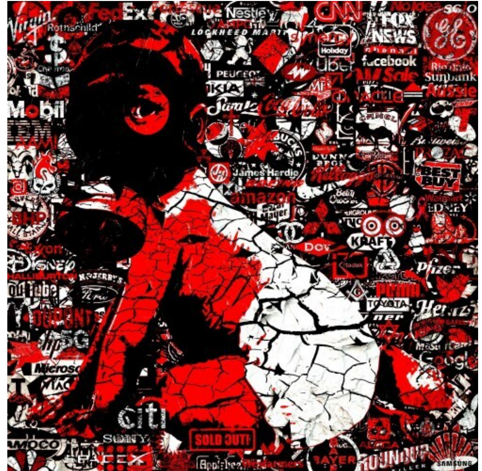
We Own You , 2022, archival print on Hahnemuhle hemp paper on aluminium, Edn. 1/5, 110 x 110cm, $2200