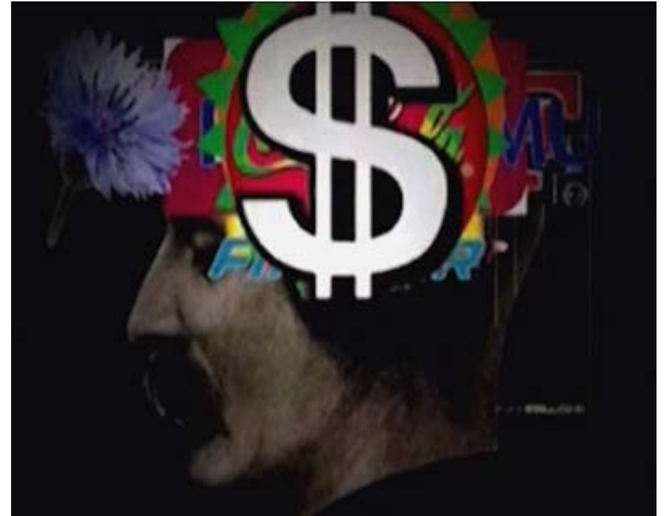
History Repeats , 2022, digital video, Edn. 1/5, 4 minute loop, $1500