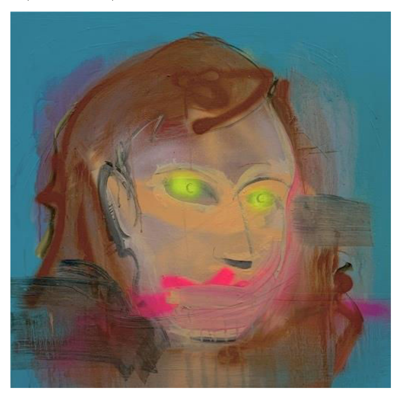
"Refrain. Reflect. Reset. (Art in the Time of Corona)", Various artists · STALA CONTEMPORARY, 10 July 2020 ·

STALA CONTEMPORARY's collection of artistic responses to pandemicinduced isolation is a must-see, writes Belinda Hermawan; not just a snapshot but a call to persevere.