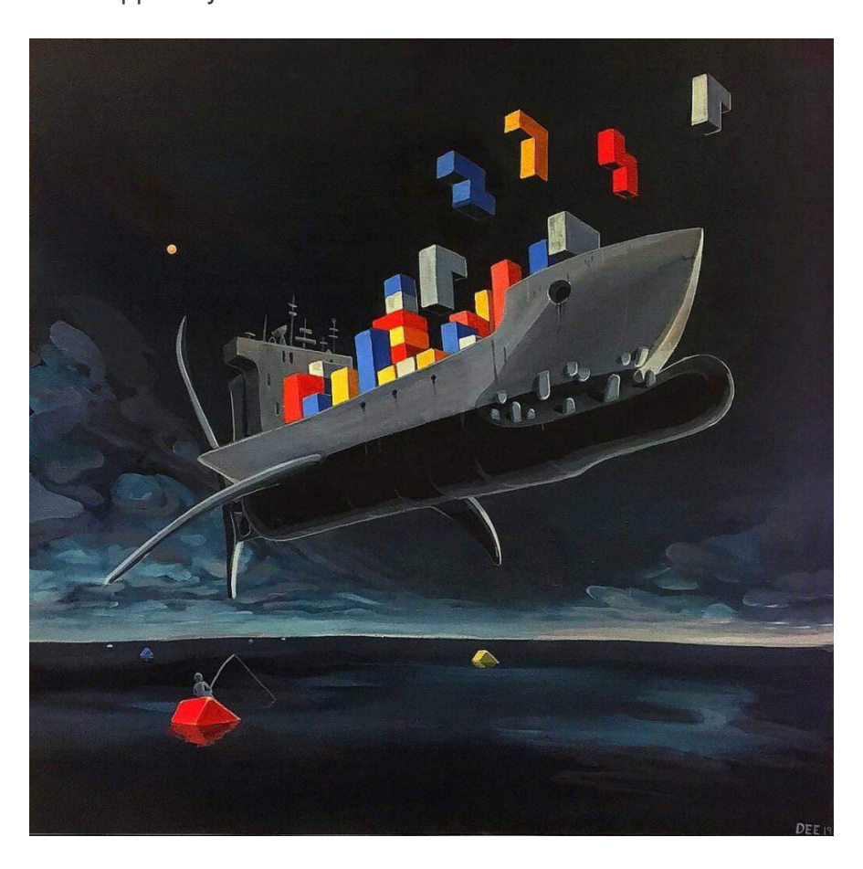
'Shark Boat' by Liam Dee.

In looking at the pandemic response on a larger scale, society finds itself between a rock and a hard place in balancing public health and the economy. In what is the exhibition's true highlight, Britt Mikkelsen's breathtaking sculptural work suspends miniature human figures in resin between two layers of stone. Its relic or fossil-like quality implies that this is a cross-section of society; humanity preserved in amber, underground and safe yet also trapped by what lies above.