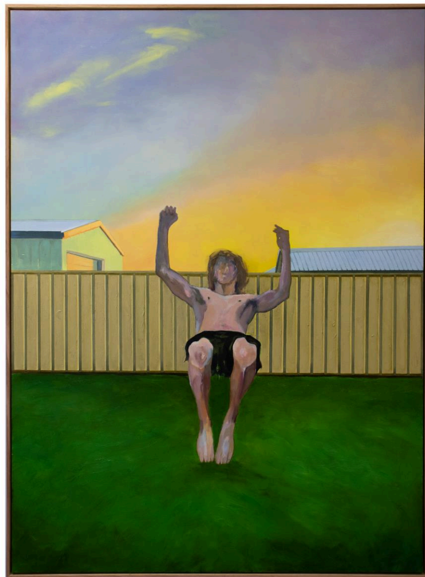
Peach Fuzz 2022 oil on wood (framed) 124.5 x 92.5cm $4200