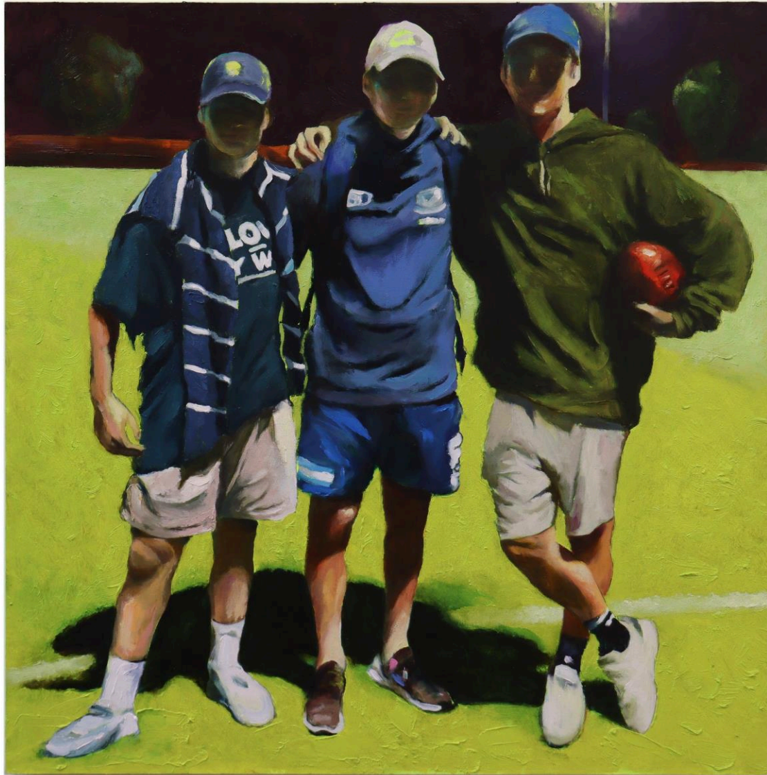
due for a pic 2022 oil on wood (framed) 62.5 x 62cm $2600