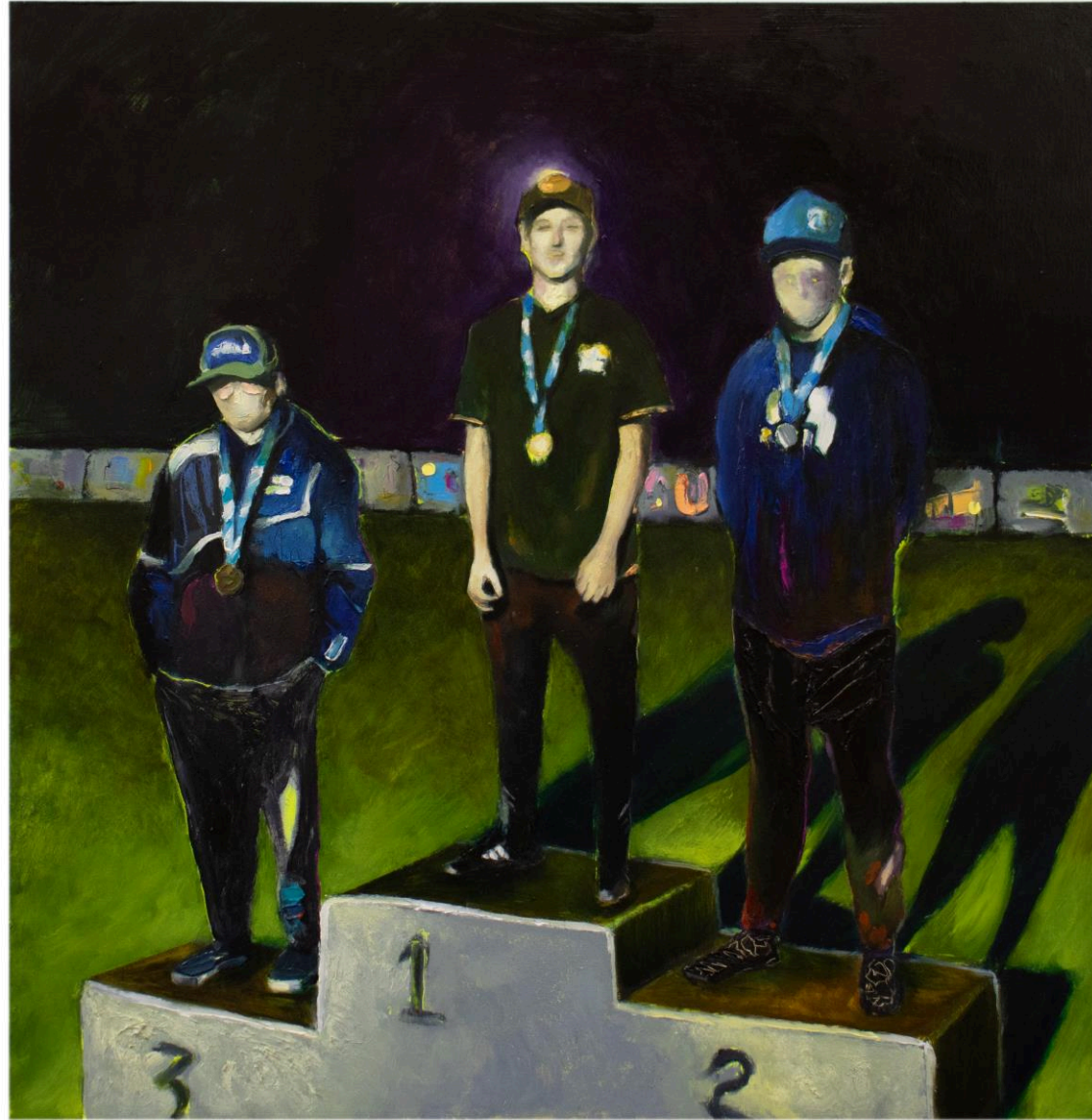
Clear the Runway 2022 oil and oil pencil on wood (framed) 62.5 x 61cm $2600