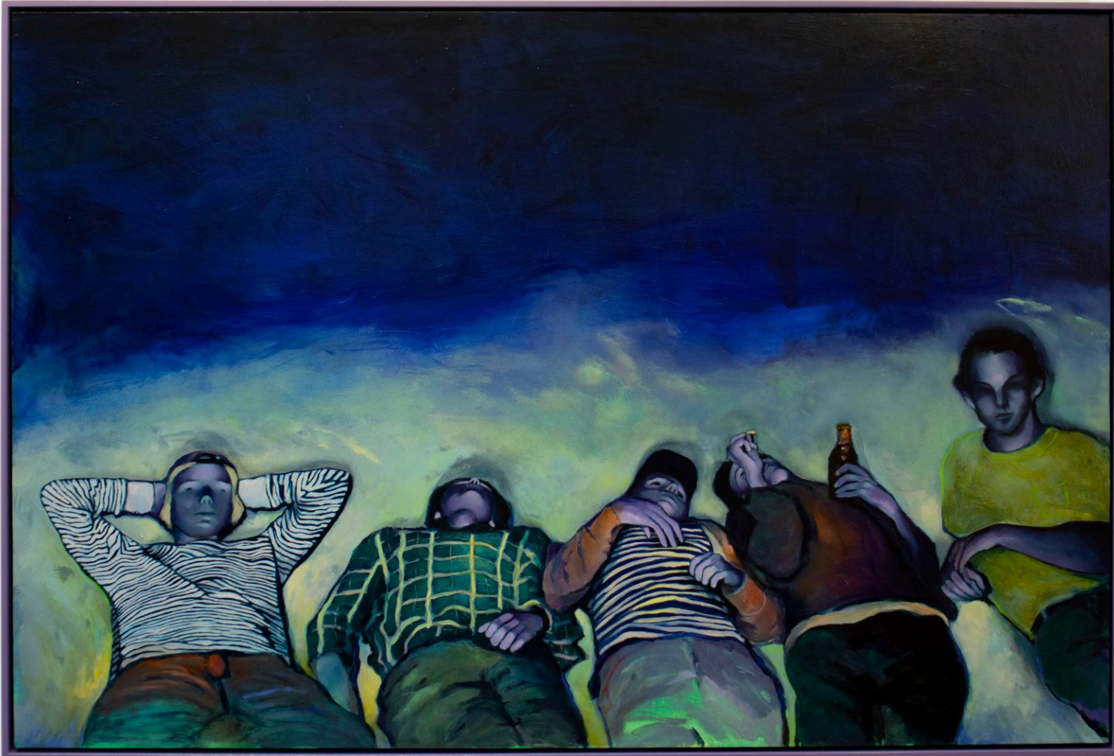
Business Meeting 2022 oil on wood (framed) 83.5 x 124.5cm $4200