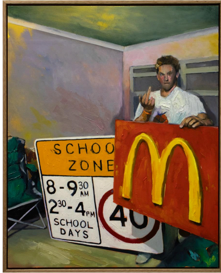
Imp 2022 oil on wood (framed) 63.5 x 51cm $2400