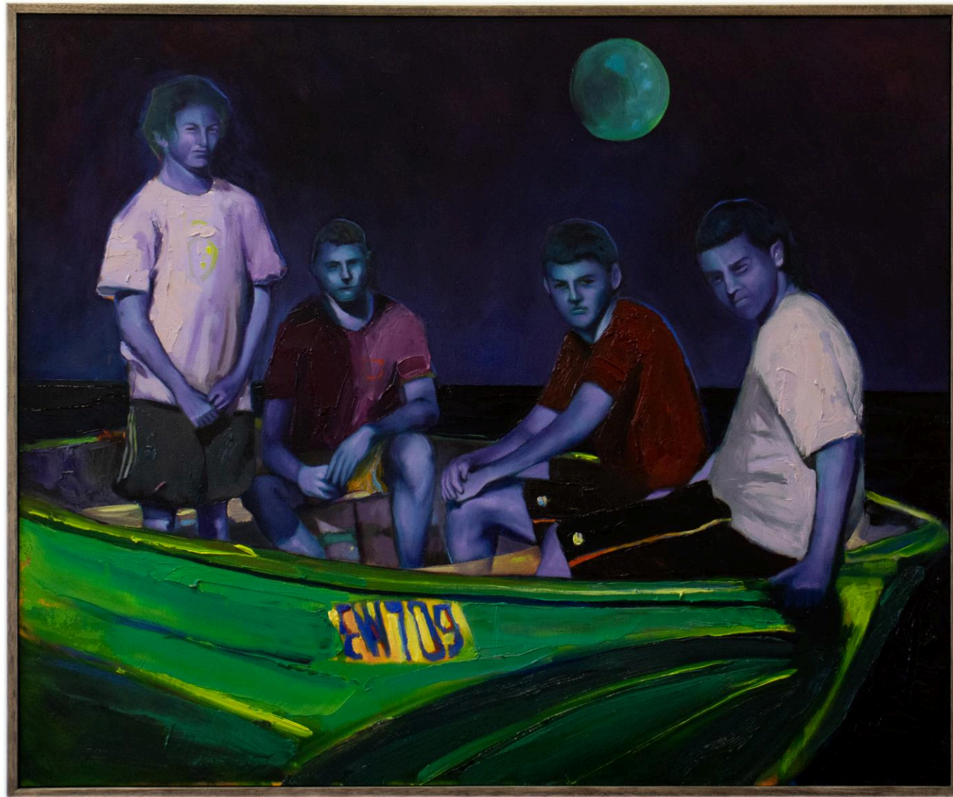
Bust Up 2022 oil and aerosol on wood (framed) 60.5 x 73cm $2800