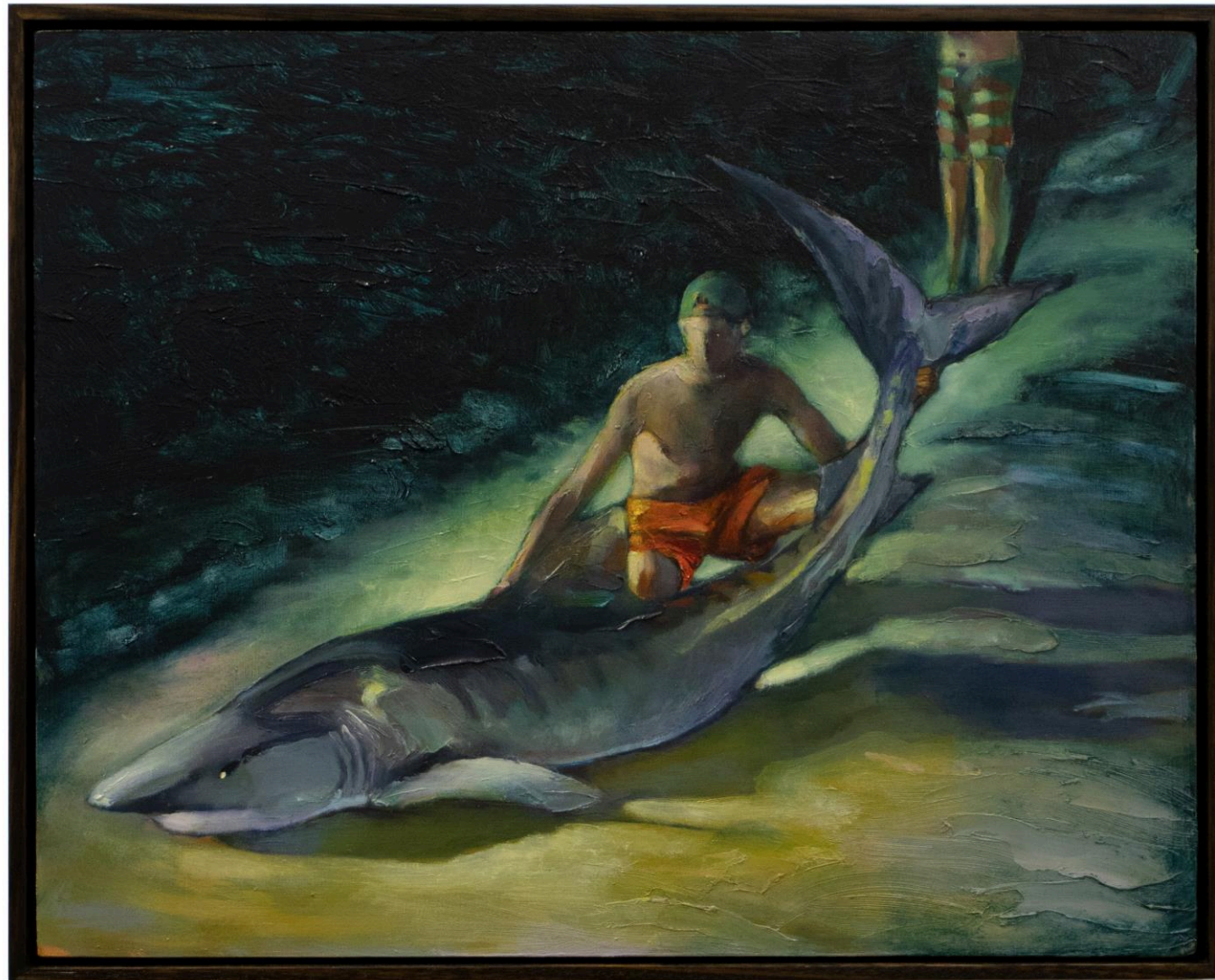
Nugget 2022 oil on wood (framed) 42.5 x 53cm $1800