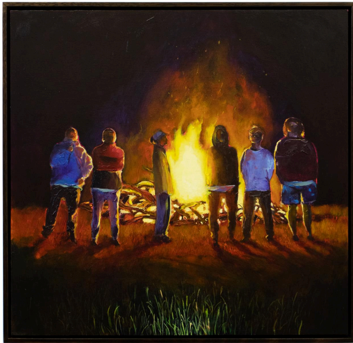
On and Hissing 2022 oil on wood (framed) 59 x 60.5cm $2600