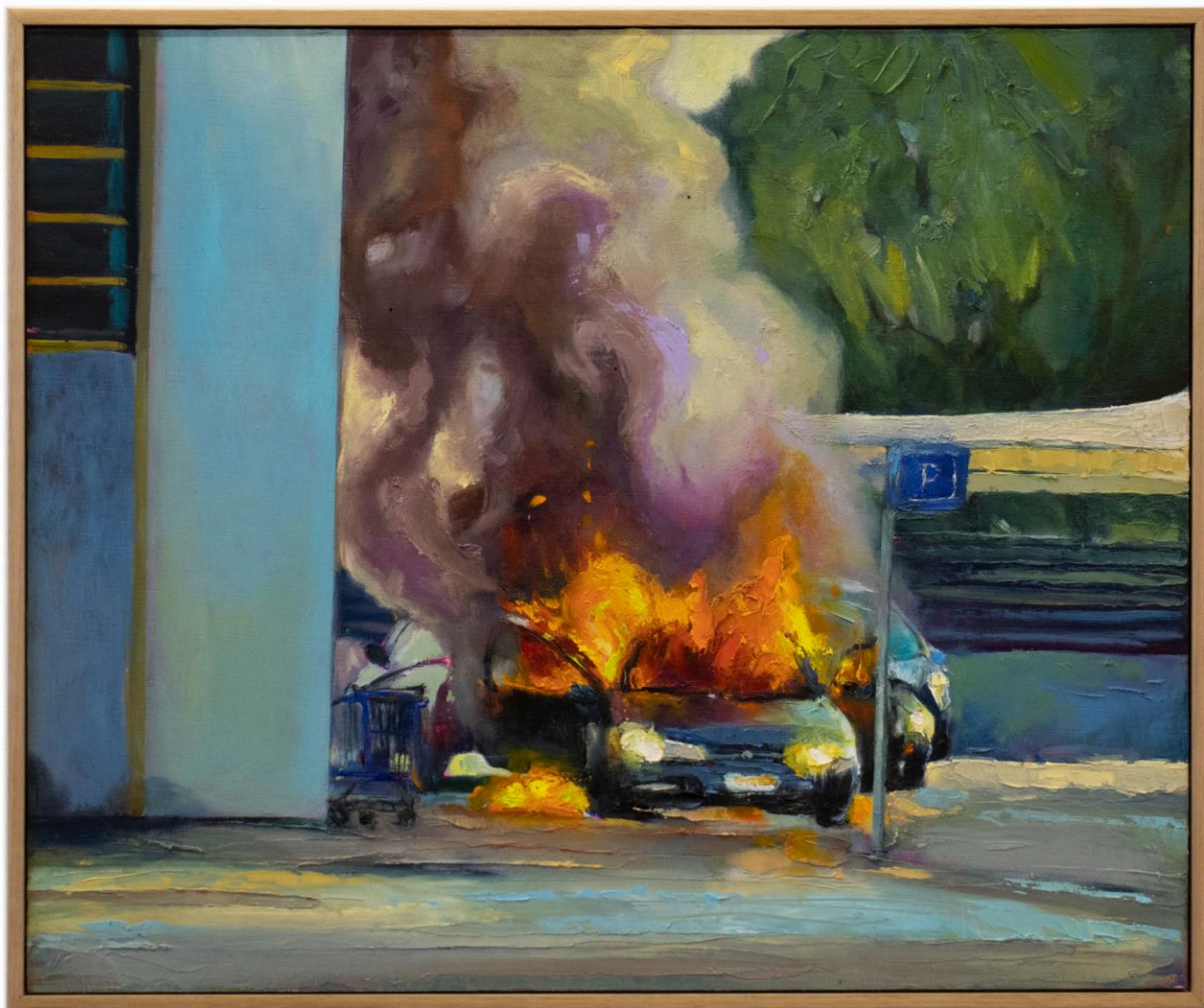
lets trot 2022 oil on wood (framed) 43 x 51.5cm $1800