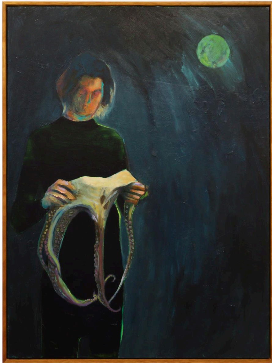
Glass Out 2022 oil on wood (framed) 83 x 62.5cm $2900